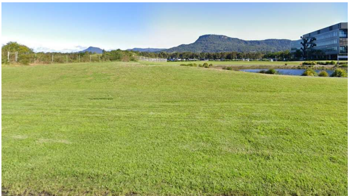
Looking westward from Squires Way frontage