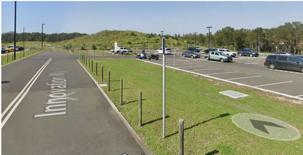
Looking south along Innovation Way to its existing termination; stockpile to the south-west; P5 car park to the west. [P5 car park and RACF/ CCC location]