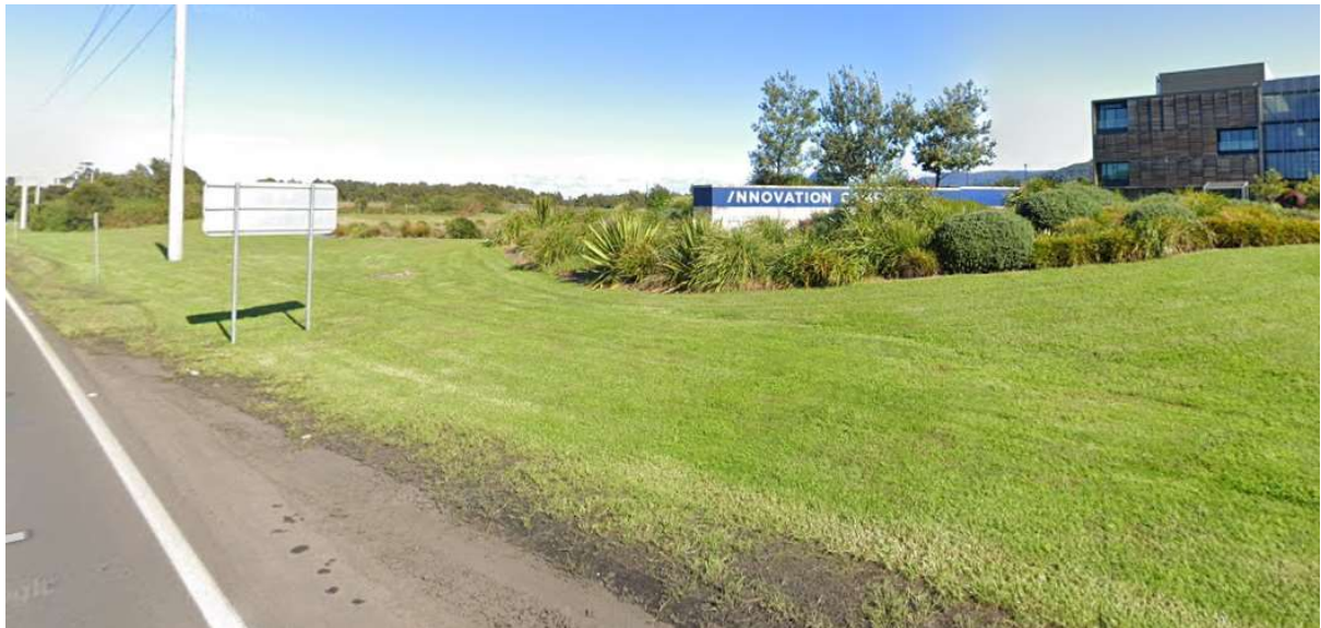
Looking south-west from Squires Way frontage – taken from north of the site