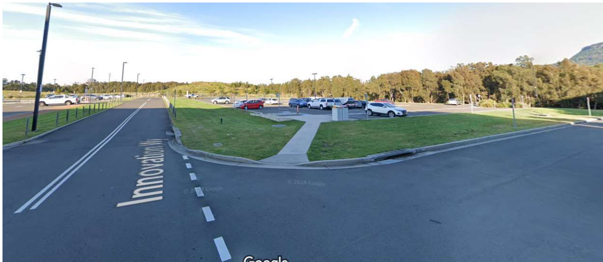
Looking south along Innovation Way towards P5 car park