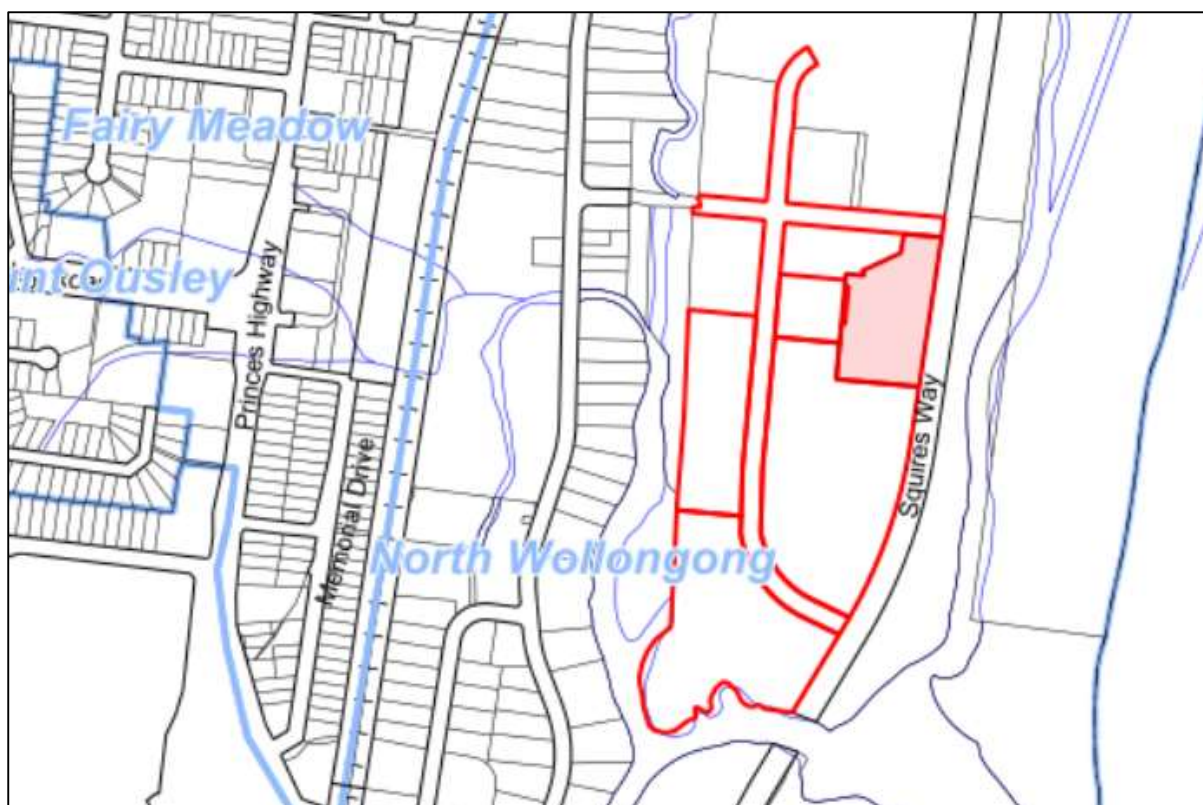
Subject site outlined in red