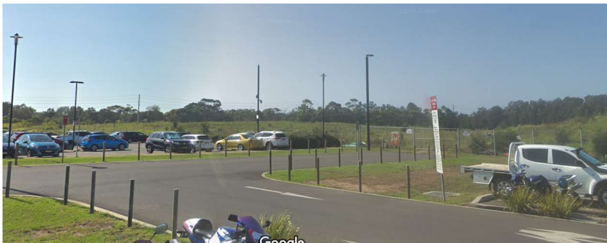
Looking south-east from P5 towards Squires Way – towards the future Green Heart and ILA Stage 2