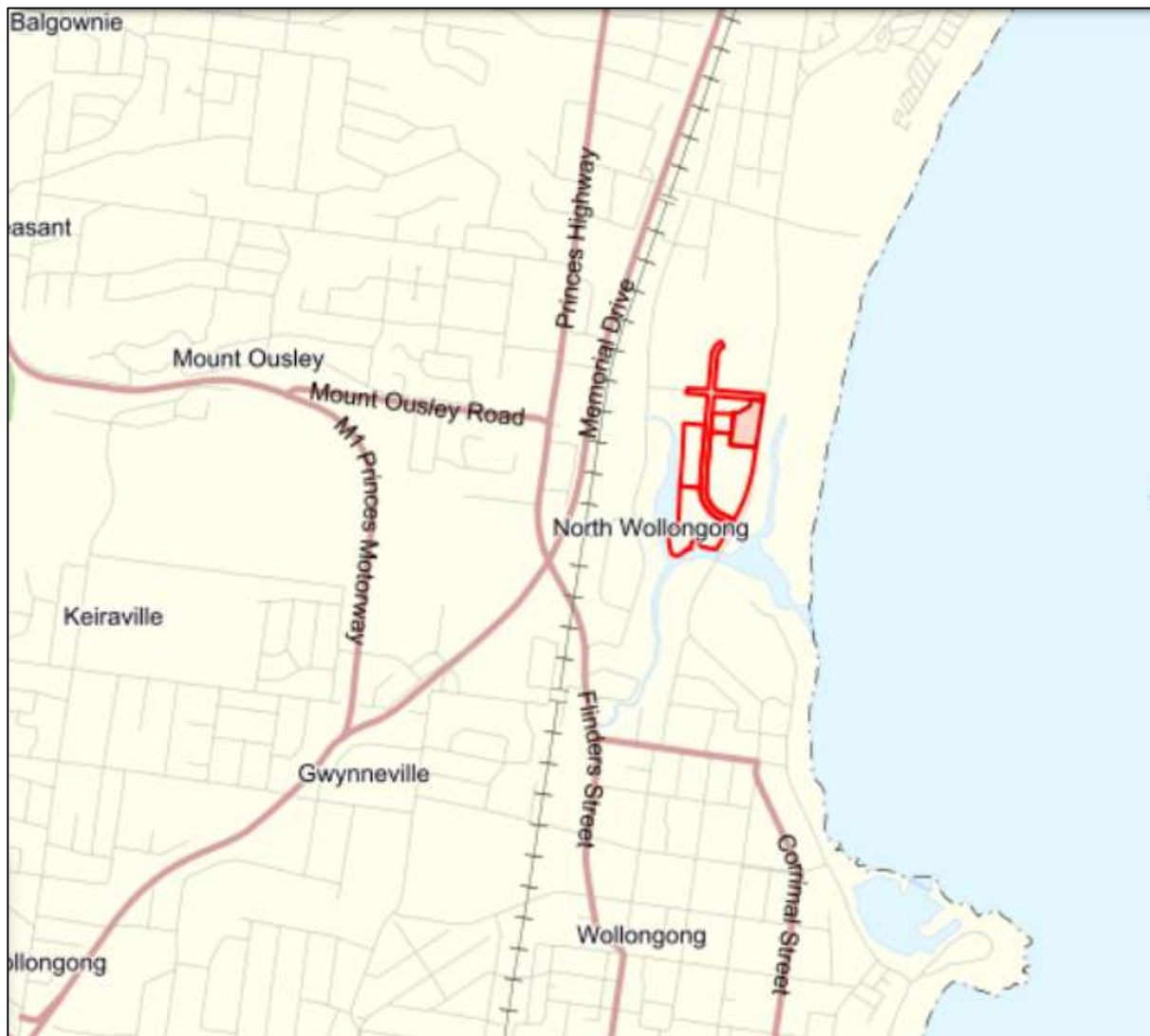
Site outlined in red, within broader locality