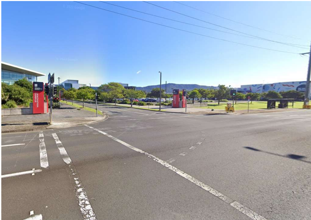
Existing primary entry from Squires Way – intersection of Puckeys Avenue and Squires Way